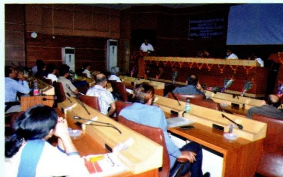
Glimpses of Workshop on Surgery