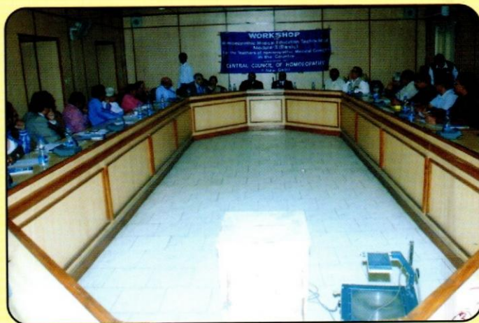
Workshop on Homoeopathic Medical Education Technology Module-II (Basic) conducted by Central Council of Homoeopathy at Nehru Homoeopathic Medical College, New Delhi