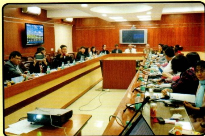
Interaction with the Thailand Delegation held on 14th February, 2013

The Secretary, Inspector and Assistant Secretary (Admn. & Registration) of the Central Council of Homoeopathy also interacted with the said team from Thailand.