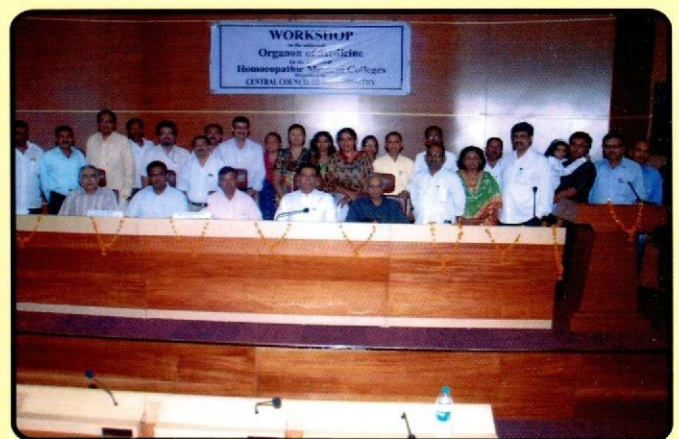
Group Photo of participants, resource persons, officers (of CCH) with President and few members of P.G. Committee of CCH