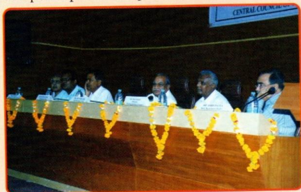
A Glimpse of Dais during Inauguration Session of the Workshop on Organon of Medicine held on 12th-14th July 2012