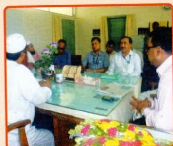
Principal, Govt. Homoeopathic Medical College is apprising the Indian experts about the functioning of the college and hospital.

The team apprised the Registrar about the status of Homoeopathic education and research in India. During the discussions, the Deputy Registrar, University of Dhaka, Chairman and Registrar of Bangladesh Homoeopathic Board were also present.