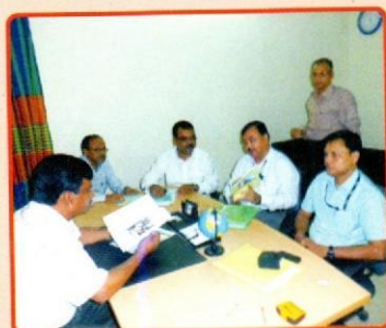
Indian experts in a meeting with the Chairman, Bangladesh Homoeopathic Board

Director (A.M.C) apprised the team of experts about the status of Homoeopathic medical services as well as other Alternative medical system of medicine in Bangladesh.