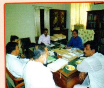
Indian experts in a meeting with the Chairman, Bangladesh Homoeopathic Board

The experts visited the Degree level Homoeopathic Medical College at Mirpur run by the Govt. of People's Republic of Bangladesh. The college has been established in 1989 in 3 Acres of land. It is affiliated to University of Dhaka and running B.H.M.S. Direct Degree course. The Government of Bangladesh under HPNSDP July'11-June'16 has made provision for production & research unit in Govt. Homoeopathic Medical College at Dhaka.