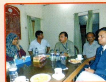
Principal, Bangladesh Homoeopathic Medical College briefing about the college to the Indian delegation.

Homoeopathic College in the country (University of Dhaka in the year 1986 declared it as Constituent College of the University). The college was initially started on 5 th July, 1948 with HMB course, under Pakistan Homoeopathic Board.