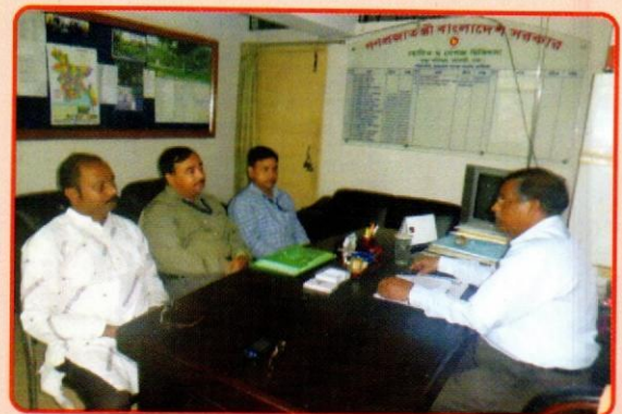
Director (AMC) apprising the status of Homoeopathy in Bangladesh.