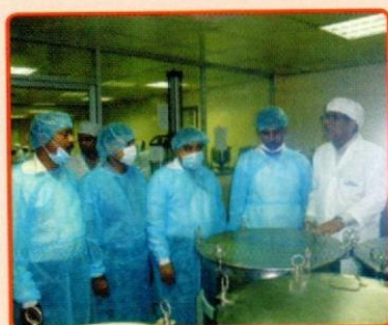
Managing Director of Maxfair & Company, demonstrating the process of manufacturing of Homoeopathic drugs.

The team visited the factory of a leading Homoeopathic medicine manufacturer of Bangladesh (Maxfair & Company Limited) at Dhamsona (Sreepur), Ashulia, which is also an exporter of Homoeopathic Medicine.