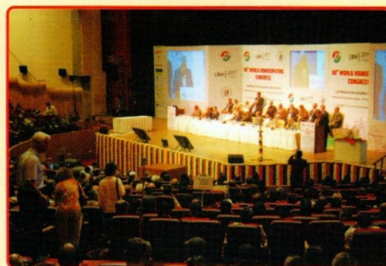
Glimpses of participation in the Congress by the delegates from different countries