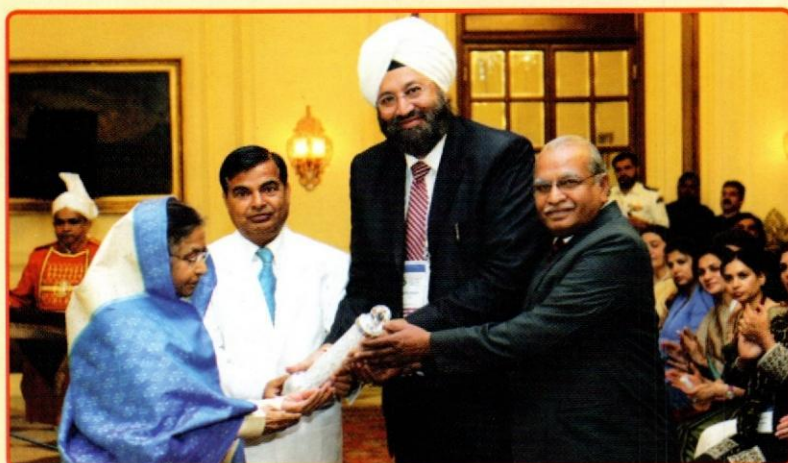
Leaders of Homeopathy (in India) presenting mementos to Her excellency the President of India

On 4 December, 2011 i.e., on the closing day of the Congress, LMHI office bearers and representatives of other collaborating agencies, ceremoniously presented an Official Memorandum and Souvenirs to Her Excellency the President of India, Smt. Pratibha Devi Singh Patil at a reception in the Rashtrapati Bhawan requesting for the continued support of the Indian Government for promotion of Homeopathy in India, the country that has become the homeopathic hub at present with the highest number of homeopathic medical colleges, hospitals, doctors, and followers of Homoeopathy to lead world.