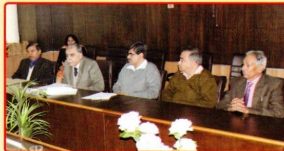
Glimpses of interaction between the representatives of Republic of Maldives and Central Council of Homoeopathy